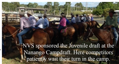
NVS sponsored the Juvenile draft at the Nanango Campdraft. Here competitors patiently wait their turn in the camp.

Horses benefit from regular dental work. For our clients with more than a few horses, we have a package of 10 horse dental examinations and floating, including sedation, for only $990 including GST.