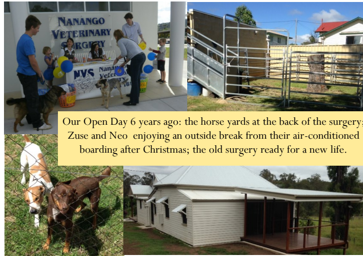
Our Open Day 6 years ago: the horse yards at the back of the surgery; Zuse and Neo enjoying an outside break from their air-conditioned boarding after Christmas; the old surgery ready for a new life.

summer and winter. Our horse yards are a great asset and are now fully functional after the removal of the large (bat-attracting) cadagi gum. We think it is one of the best country surgeries we know of and we want to keep improving. It doesn't feel like 6 years but time flies when you are having fun!